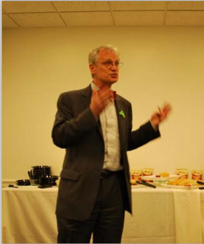
Congressman Earl Blumenauer (D-OR)