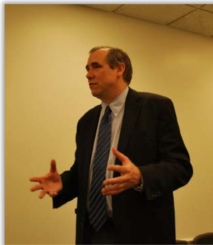
Senator Jeff Merkley (D-OR)