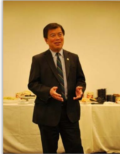
Congressman David Wu (D-OR)