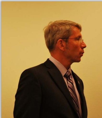
Congressman Kurt Schrader (D-OR)