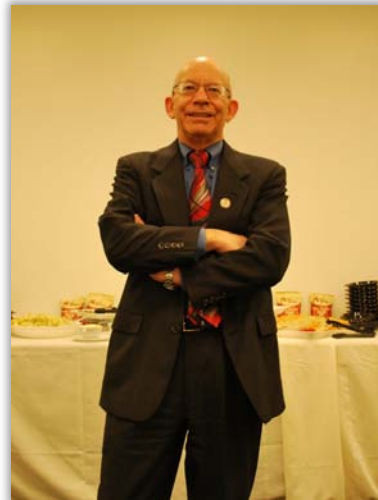
Congressman Peter DeFazio (D-OR)